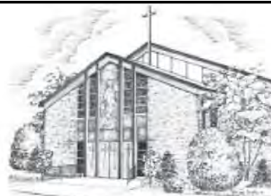
Over 60 years of Faith and Service!

Christian Foundations for Ministry (CFM) program, sponsored by the Archdiocese of Newark, is a three year course of studies which meets eight weeks in the Fall, Winter and Spring: